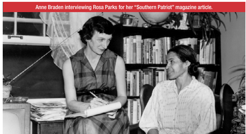
Anne Braden interviewing Rosa Parks for her "Southern Patriot" magazine article.