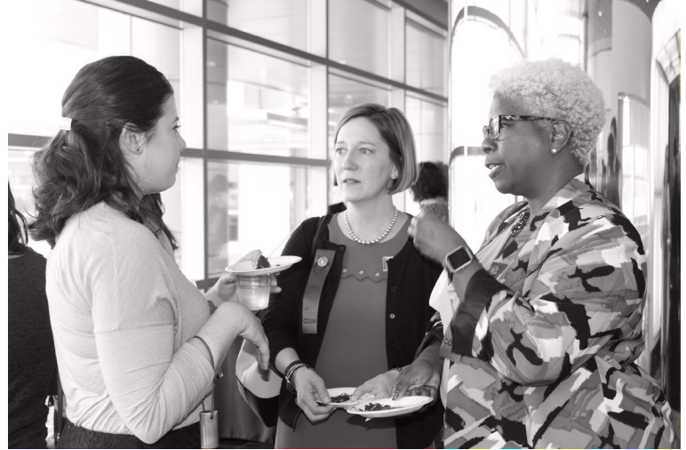
HSC Open House