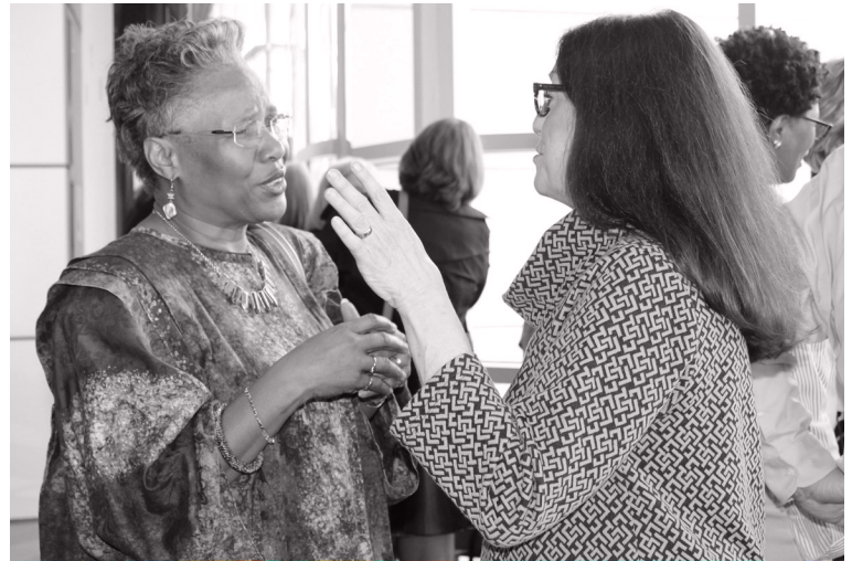
HSC Open House