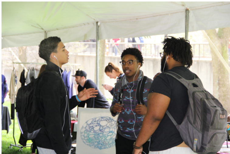
Students at the Art & Cultural Fair in March.