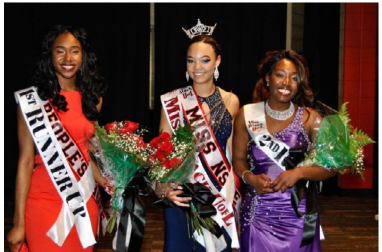
Miss Black UoFL Pageant 2017