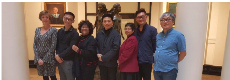
Attendees at the Film Festival.