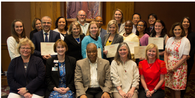
May 25th, Deans Forum Group photo

Respectfully submitted by members of the Faculty Concerns Committee