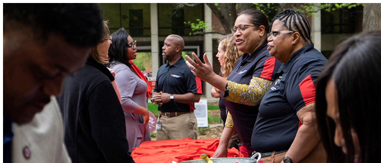
CODRE Open house on the Quad