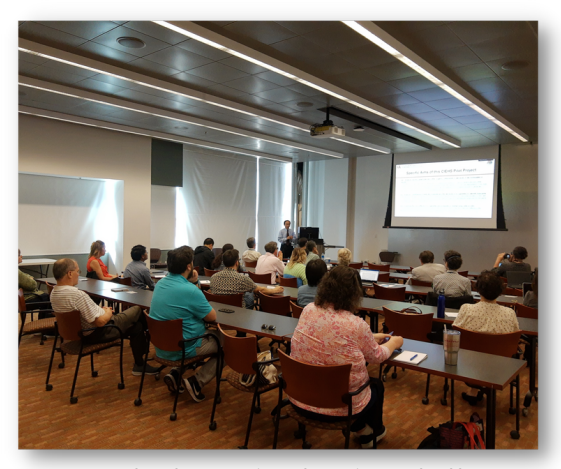
CIEHS Research Voucher Presentations and P30 Environmental Health Sciences Pilot Project Research presentations