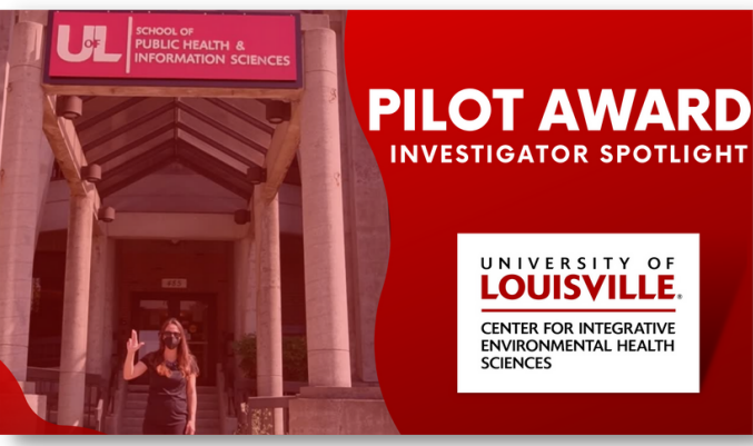
Screenshot from CIEHS Pilot Project Awardee Spotlight video