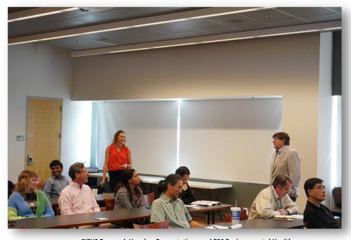
CIEHS Research Voucher Presentations and P30 Environmental Health Sciences Pilot Project Research presentations