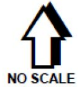
FIGURE 1.1 WATERSHED BOUNDARY MAP