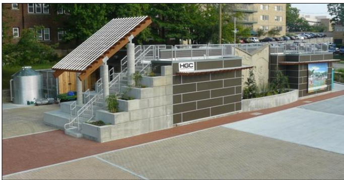
The Green Learning Station.

particular” about ways to avoid allowing runoff from the site to infiltrate into groundwater (R. Mooney-Bullock, personal communication, January 22, 2012). Adding to the challenge of keeping contamination out of the water, the soil on the site is heavy clay, which complicates uses of common infiltration practices used more easily on looser soils that drain water more quickly.