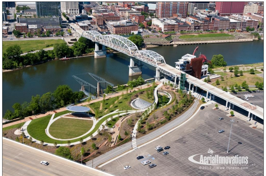
(above) A view of Cumberland park. (below) Cumberland Park aerial view.

Since this was the first of the parks to be developed as part of a riverfront master plan's goal to increase recreational space in Nashville, the city wanted to set a high bar for design standards and a sustainability baseline for future design developments. Koster saw the park as a unique opportunity. It was funded with public money and intended to be a park that is free and open to the public. The intention is to allow people to come and play all year round and enjoy being near the Cumberland River. The park, in addition to its obvious recreational value, tells a story: the site was once a brownfield