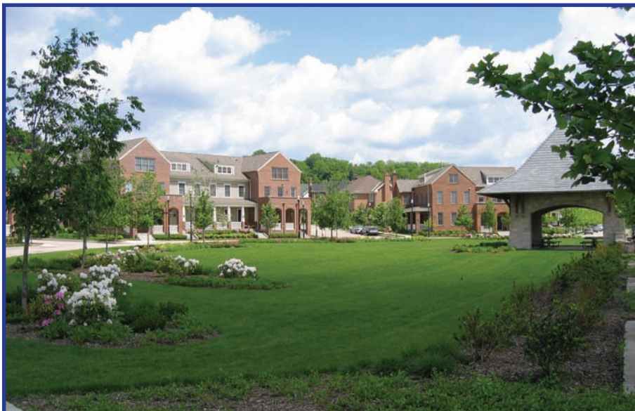
Summerset at Frick Park in Pittsburgh, Pennsylvania, built on a former brownfield.

Summerset at Frick Park features 713 housing units with 336 single-family homes, 121 townhouses, and 256 apartment units. In the process, Nine Mile Run, the last free-flowing stream in the City of Pittsburgh, was transformed as well.