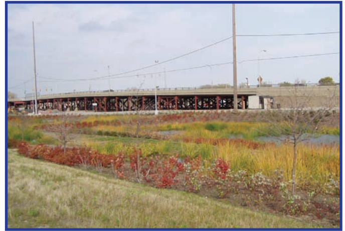
The former Rouge Truck Factory in Dearborn, Michigan utilizes landscaped swales and wetlands containing native plants, bushes, and trees to remediate soils.

Landscaped swales and wetlands containing native plants, bushes, and trees remediate the soils surrounding the building by taking up, sequestering, and even treating pollutants that accumulated during more than 80 years of manufacturing. This vegetation also provides valuable habitat for wildlife and helps to cleanse water before it enters the nearby Rouge River. Water quality monitoring data show increased levels of dissolved oxygen necessary for fish and other species to thrive. Bacteria levels are also declining, which is beneficial not only to fish but to the increasing numbers of people who enjoy spending time on the river.