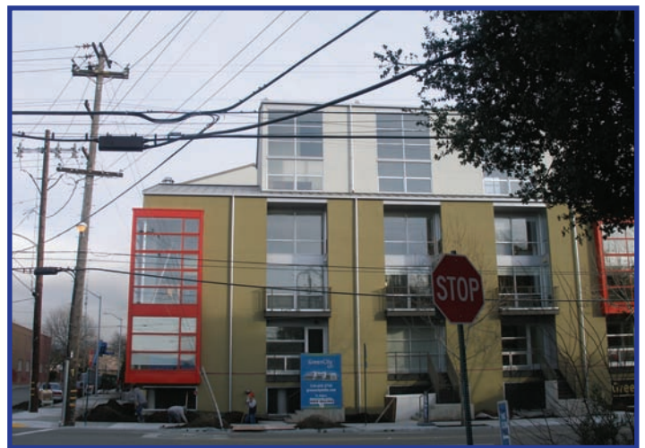
The Green City Lofts in Emeryville, California.

Emeryville, California occupies just 1.2 square miles of dense, formerly industrial land along the San Francisco Bay between Berkeley and Oakland. In the 1990s, Emeryville started a comprehensive brownfields redevelopment project to address serious economic and social costs associated with large tracts of vacant or underutilized non-residential property throughout the city. The redevelopment of several targeted brownfields had many positive outcomes for the city, such as new jobs and residents, and increased income and tax revenue, but also had negative environmental impacts by increasing overall impervious surfaces contributing to runoff and non-point source pollution.