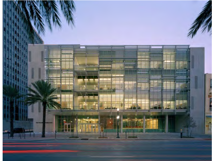
The BioInnovation Center is a home for 35 budding life sciencesrelated businesses in downtown New Orleans, providing them with space, business development support, and educational and networking opportunities.