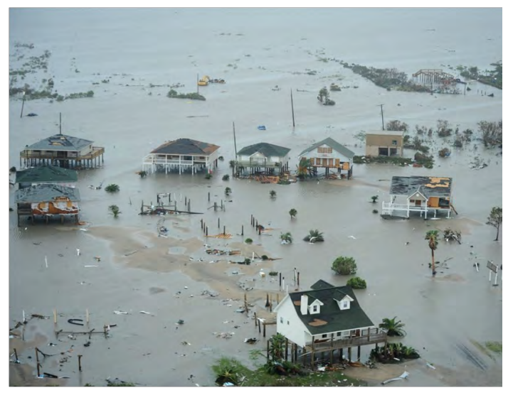
Homes across the region were damaged or destroyed by Hurricane Ike. This Galveston Island neighborhood was particularly hard-hit.

into the RLF rather than relying on their general funds for upfront costs, they are able to maintain their traditional levels of service while investing in the recovery and resilience measures necessary to keep their area economically competitive.