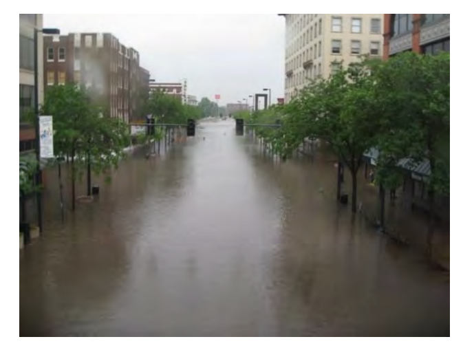
The view of flooded 3rd Avenue in downtown Cedar Rapids.