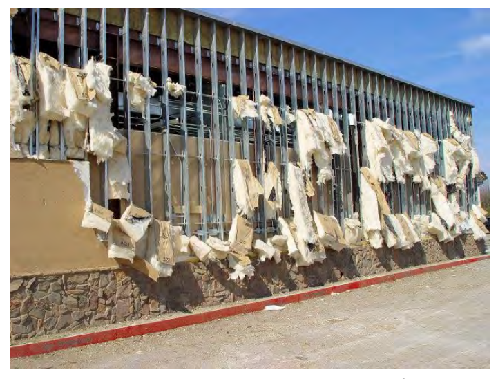
The 2008 tornadoes impacted critical community infrastructure and facilities across the state, like this hospital in the city of Mountain View, in north central Arkansas.

SWAPDD also leveraged the EDA grant to obtain $150,000 from the Delta Regional Authority for additional employer and infrastructure mapping and economic resilience planning in four Delta counties within their region.<sup>6</sup>