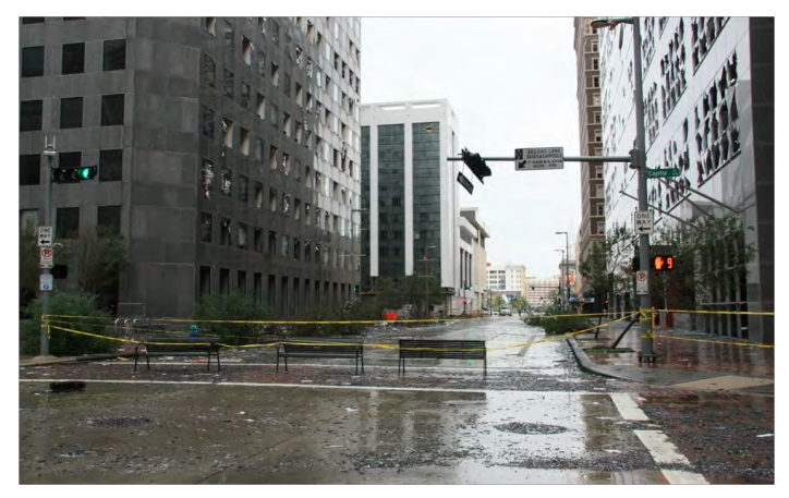
This section of downtown Houston's Travis Street was one of several roadways that were temporarily closed due to debris left by Hurricane Ike.

During the recovery planning process, H-GAC recognized the importance of getting local businesses back on their feet. While the enthusiasm was there, access to financial capital proved to be a real barrier for many business owners. To help local businesses tackle this problem, GCEDD secured $10 million in EDA funding to capitalize a revolving loan fund (RLF) for recovery and economic development efforts. The RLF was originally restricted to private busi-