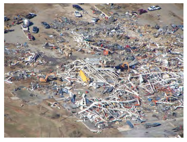
Businesses across Arkansas were damaged or destroyed by the 2008 tornadoes. This boat building business in the city of Clinton, in north central Arkansas, was particularly hard-hit.

SWAPDD received $150,000 from EDA in 2009 to develop a comprehensive database of information on the employers and infrastructure in the region. For businesses, staff collected data on location, number of employees, and contact information when owners wished to provide it. For infrastructure, they gathered information on the locations of critical facilities and transportation infrastructure, as well