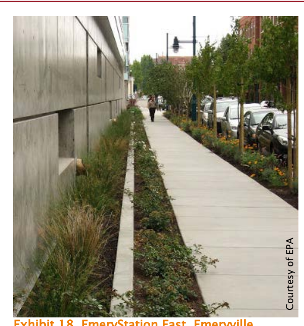
Exhibit 18. EmeryStation East, Emeryville, California. This 20,000-square-foot office building next to the Amtrak Intermodal Transit Center in Emeryville uses bioswales along the side of the building to capture and filter rainwater from the roof while adding greenery to the neighborhood.

The city of Emeryville, California, is located on formerly industrial land along the San Francisco Bay. The area is densely developed with relatively little open space and has contaminated soils in many areas. The city needed to carefully consider how best to implement green infrastructure approaches to ensure that infiltration of stormwater would not contaminate ground water with pollutants picked up as water percolates through contaminated soils. EPA funded a grant to develop