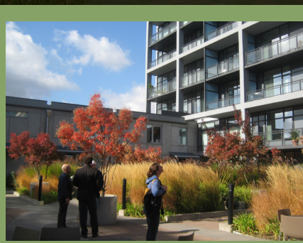
Office of Sustainable Communities Smart Growth Program