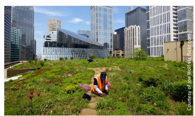
Exhibit 5. Green roof on City Hall, Chicago, Illinois. The city of Chicago created a green roof on its city hall to test the performance of the technology and understand how green roofs could help the city achieve its climate action goals. The roof can be as much as 30 degrees cooler than surrounding roofs in the summer. It reduces the use of air conditioning in the building while absorbing rainfall that would otherwise run into storm sewers.

Recognizing such benefits, the city of Chicago's Climate Action Plan calls for 6,000 new green roofs. more than a million new trees, a watershed plan that factors in changes expected due to climate change, and other actions. 12 In the first two years after implementation, more than 4 million square feet of green roofs were completed or planned, and 32,000 square feet of Chicago alleyways were reconstructed with permeable materials. 13