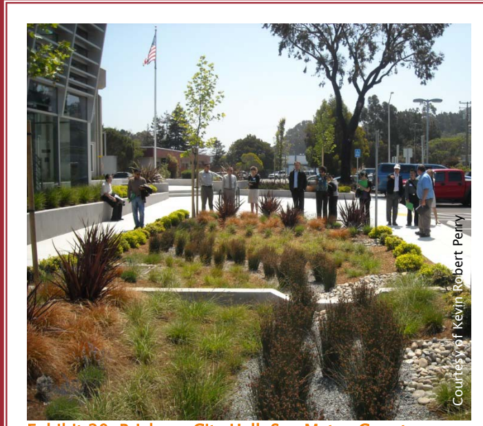
Exhibit 20. Brisbane City Hall, San Mateo County, California. Redesigning the parking lot for the Brisbane City Hall created space for a rain garden that captures stormwater from the building and parking lot. The redesigned parking lot accommodates the same number of cars. The city also gained an outdoor gathering space, room for bicycle parking, and a safer and more inviting entrance to the building.

In 2008, Minnesota voters voted to increase the state sales tax by 0.375 percent, with one-third of the collected revenues going to a Clean Water Fund that provides grants to local projects. 112 Among the funded projects is one installing rain gardens, stormwater planters, infiltration trenches, and more than