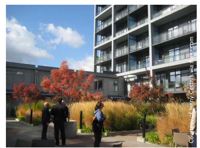
Exhibit 16. The Louisa, Portland, Oregon. This LEED Gold-certified, mixed-use building in Portland's Pearl District has a green roof that serves as a private outdoor gathering place for residents while reducing stormwater runoff and helping to cool the city.

Many municipalities discount stormwater utility fees as an incentive to install certain green infrastructure practices. Minneapolis