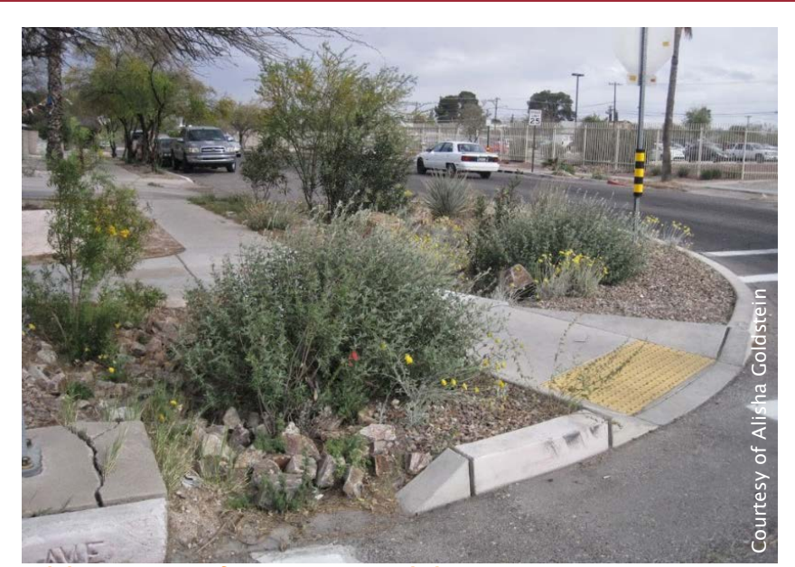
Exhibit 2. Green infrastructure in arid climates, Tuscon, Arizona. Curb extensions with inlets to collect rainwater from the street show how even arid climates can use green infrastructure to manage stormwater and make neighborhoods more attractive.

areas. For example, many people think of green infrastructure as an approach only for wet climates. However, it can also manage stormwater and conserve water resources in arid regions if designers select plants for their drought tolerance and use other landscaping techniques that reduce the need for irrigation.5