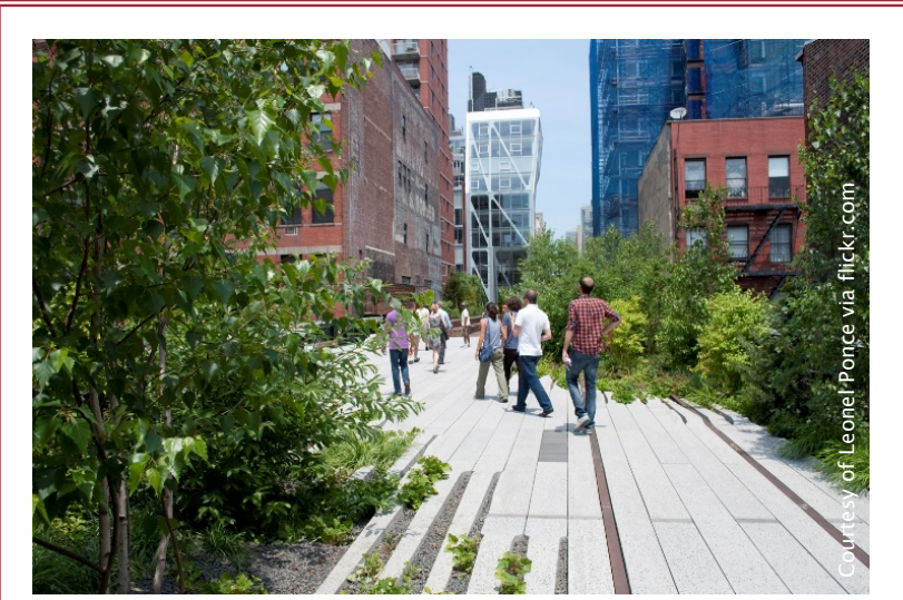
Exhibit 21. High Line, New York City. An elevated former railroad track in New York City has become a linear park more than 20 blocks long. The entire length incorporates native, drought-resistant plants that absorb and filter rainfall. The park provides a place for recreation and cultural events and creates a safe way for bicyclists and pedestrians to travel in the city. Real estate development along the line has skyrocketed, helping to make the popular park a successful economic development project.

program and increasing the number of monitoring stations at the mouths of key tributaries to help track how pathogen levels are affected by reductions in combined sewer overflow events.<sup>117</sup>