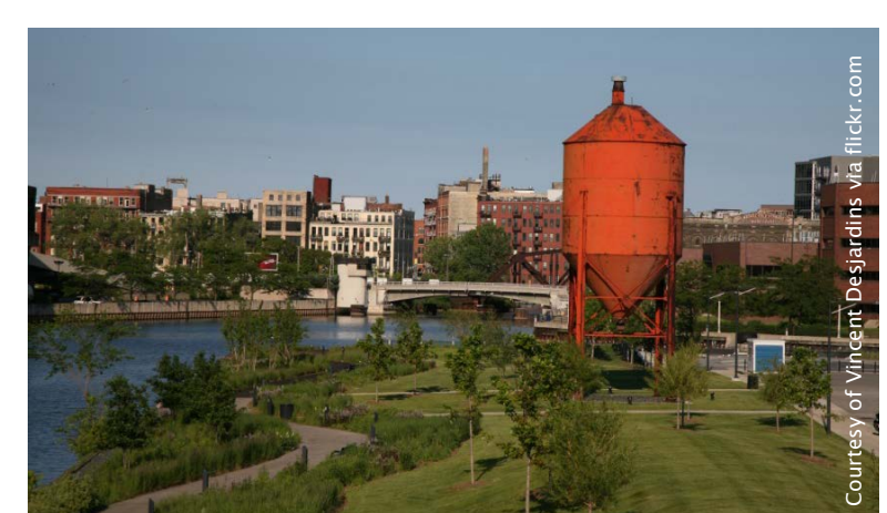
Exhibit 19. The Hank Aaron State Trail, Milwaukee, Wisconsin. Redevelopment of a former 1,200-acre brownfield in the Menomonee River Valley incorporates a stormwater park with a multi-use trail. The area now houses the Harley Davidson Museum and more than a dozen other businesses that have created roughly 4,200 jobs since 1998.

The city of Milwaukee worked with partner agencies and organizations to develop a plan to revitalize the 30th Street Industrial Corridor. The plan incorporates green infrastructure to manage stormwater to improve water quality and promote economic development. Because the area is a former industrial corridor with more than 200 brownfield sites in or adjacent to the corridor, the city had to consider the