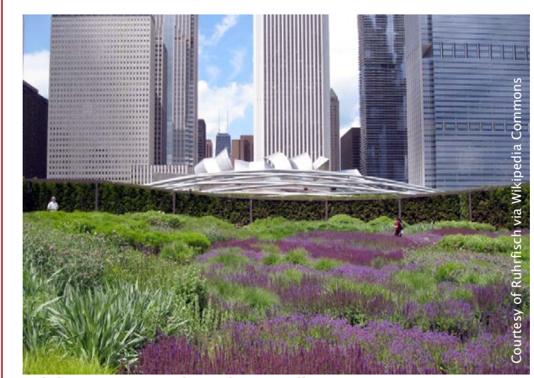
Exhibit 7. Lurie Garden, Chicago, Illinois. Lurie Garden in Millennium Park is a 2.5-acre rooftop garden on top of a parking garage. Native plants provide critical wildlife habitat while creating an urban oasis for residents and visitors.

Illinois legislature to reduce the required local match for state funds to acquire land for parks and open space for these communities. In 2013, the Illinois legislature reduced the local match from 50 percent to 10 percent for distressed communities, which should help distribute open space in the region more equitably.<sup>33</sup>