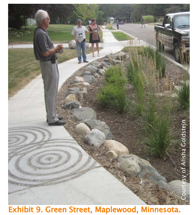
Exhibit 9. Green Street, Maplewood, Minnesota. Rain gardens along the curb capture stormwater from the street and make the neighborhood a more enjoyable place to walk.

The city of Maplewood, Minnesota, adopted a living streets policy framework, under which the city will rebuild streets after infrastructure upgrades to better accommodate walkers, bikers, and transit