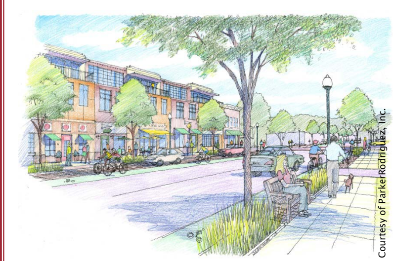
Exhibit 13. Design concept for Second Street, Frankfort, Kentucky. The city of Frankfort hosted a public design workshop as part of EPA's Greening America's Capitals Program to develop a vision for a historic commercial corridor. The city wanted to help the community visualize how design improvements could improve pedestrian and bicycle safety, reduce stormwater runoff, and encourage economic revitalization in the area. For more information on The Greening America's Capitals program see: EPA. "Greening America's Capitals." <a href="http://epa.gov/smartgrowth/greencapitals.htm">http://epa.gov/smartgrowth/greencapitals.htm</a>.

Community goals and values can affect the alternatives that property owners or local governments consider and influence how they weigh factors for selecting among options. For example, a neighborhood with a strong artist community could have artist-designed downspouts, rain barrels, or planter boxes, which can foster support for green infrastructure and longterm stewardship among residents. The Whitefish Bay Civic Foundation in Whitefish Bay, Wisconsin,