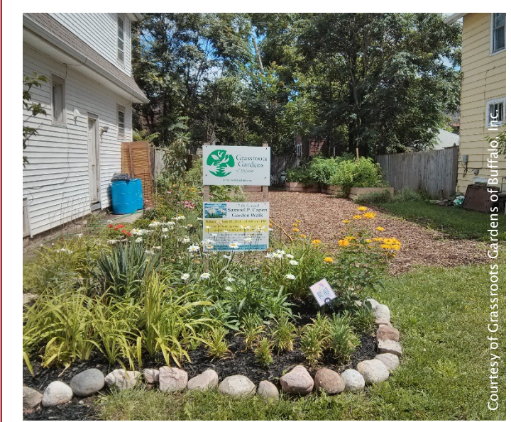
Exhibit 8. University Heights Collaborative Community Garden, Buffalo, New York. This newly planted community garden in Buffalo was built with the help of Grassroots Gardens, an organization dedicated to helping residents create and sustain community gardens on vacant properties in the city. Several entities, including churches, community centers, and nonprofit organizations, help maintain it.

its goal of reducing the number of combined sewer overflow discharges.35 In its 2012 comprehensive plan, Ranson, West Virginia, encourages selecting green infrastructure techniques to manage stormwater that can allow additional development in the city's Old Town while preserving its character.36 Improving Old Town's infrastructure will ensure that the city can accommodate development downtown where it has the least impact on natural areas and the greatest economic benefits.