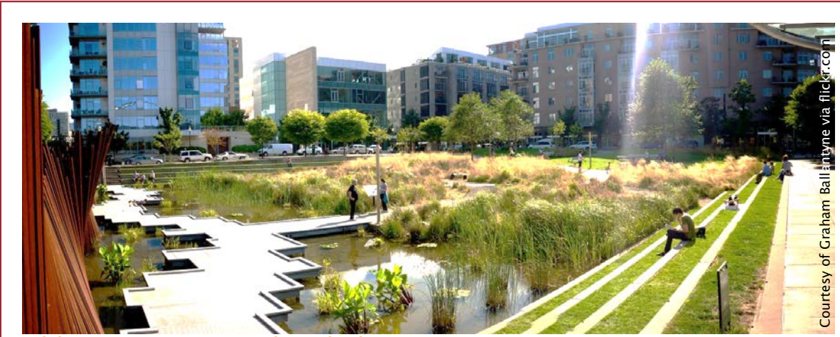
Exhibit 10. Tanner Springs Park, Portland, Oregon. Tanner Springs Park collects rain falling on the park to recreate a portion of the wetland that once surrounded Tanner Creek in Portland's Pearl District. Native plants and art installations that use reclaimed railroad track and glass from a local company contribute to the sense of place.

infrastructure is almost entirely underground where it is out of sight and out of mind. Public art and green infrastructure can be integrated into a single site, each reinforcing the sense of place established by the other. Features such as fountains fed by rain water, living walls, or artist–designed stormwater infrastructure can help enliven a space and educate visitors about ways to protect water quality (see Exhibit 17).