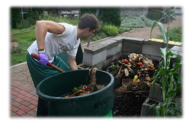
Furman University collects food waste from the dining hall and combines with leaf and limb waste in both bin- and in-vessel systems. Here a student intern has transported food waste and is adding it to one of the bins on the Furman Farm.

Kitchen staff, a university-run dining service at the University of Alabama unload pre-consumer food waste at the college arboretum where it cures over a period of 6-8 months in windrows.