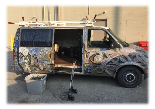
The Compost Machine serves as a vehicle to pick up and transport coffee grounds, tea, and lemon rinds sourced from a local coffee chain. This type of external networking is one example of how post-secondary institutions can connect with the surrounding community. The van is a donation from the University of Louisville's Physical Plant.

institutions, and outside establishments/ organizations to exchange information that leads to strengthening organics recovery programming. Establishments/ organizations include private waste management facilities, local businesses, and municipalities.