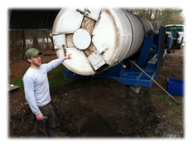
In 2011, a creative inquiry class was established at Clemson University to build momentum to the university's composting program. Faculty research groups and on average 50 students per year participate in composting through specialized coursework.

resource guides, reports, and scholarly articles on topics such as tracking program development and success, best practices, and analysis of specific techniques.