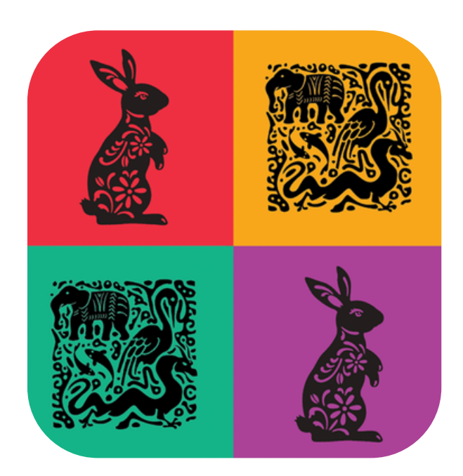
Asia Institute Crane House

The Center for Asian Democracy is proud to partner with organizations at the University of Louisville and in the Louisville community dedicated to advancing the understanding of democracy and rights in Asia.