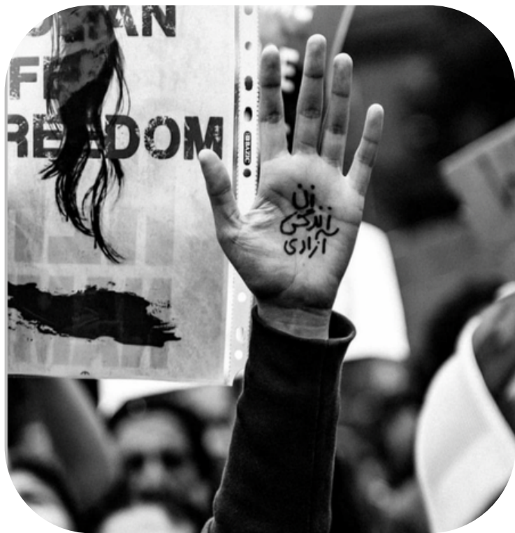
AAPI Faculty & Staff Association

Commonwealth Center for the Humanities and Society