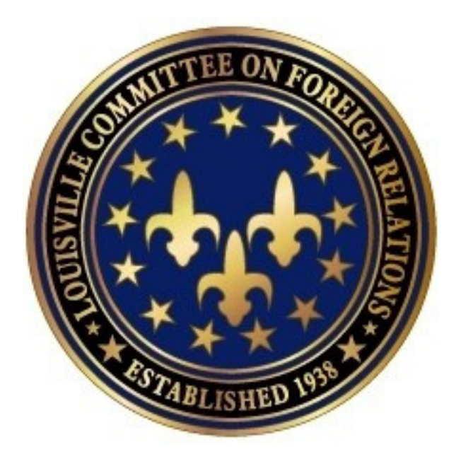
Louisville Committee on Foreign Relations

Asia Institute Crane House hosts a Lunar New Year Gala that features silent and live auction. entertainment and а variety of delicious Asianthemed cuisine from local renowned chefs. CAD joined the event to support AICH in its efforts to support the Louisvillearea AAPI community.