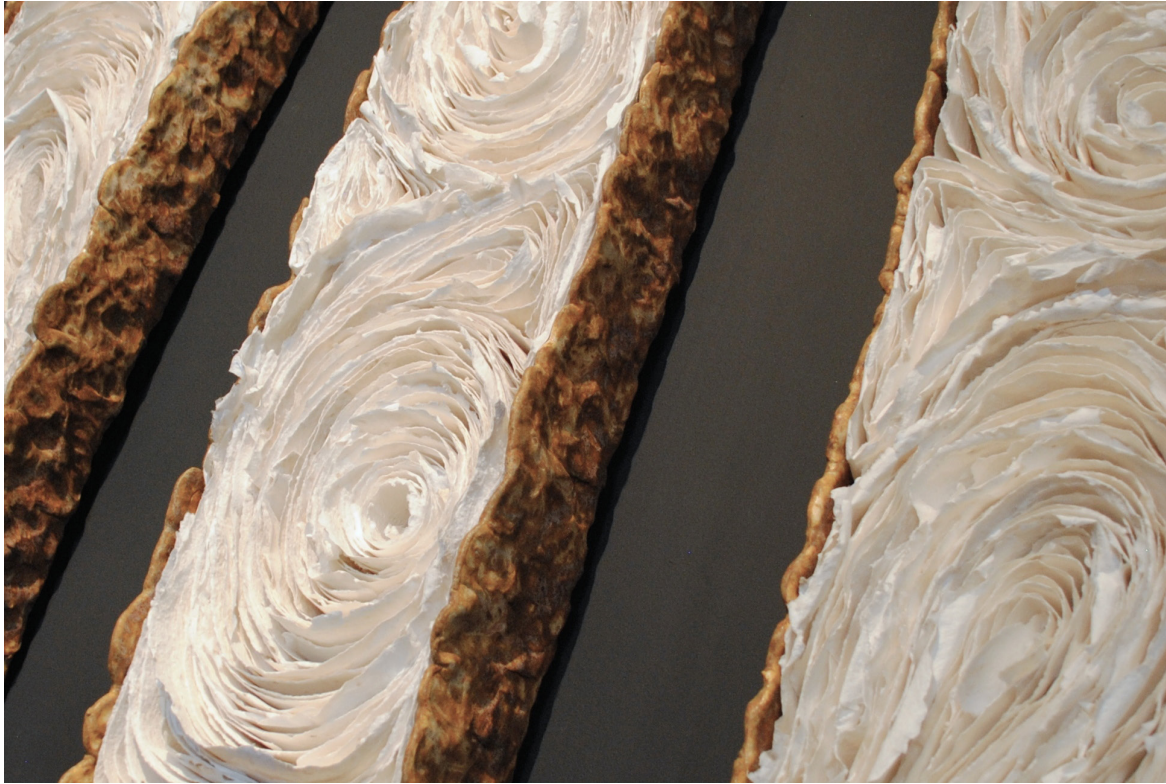
Untitled 1, Molly F. Passafiume, 2014, ceramics and handmade paper, 26" x 30"