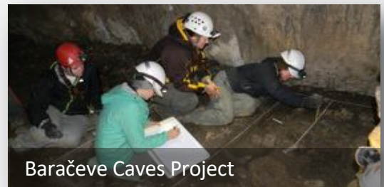
Baračeve Caves Project