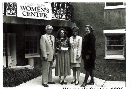
Women's Center, 1996

Bigelow Hall, Miller Information Technology Center (MITC). Call the U of L Women's Center at 502-852-8976 for more details.