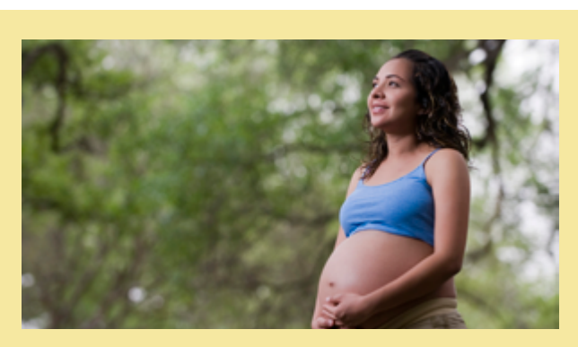
(Source: U.S. Department of Education, Office for Civil Rights, Supporting the Academic Success of Pregnant and Parenting Students under Title IX of the Education Amendments of 1972. Washington, D.C., 2013.)

To get a copy for your review, go to: http://www2.ed.gov/about/offices/list/ocr/docs/pregnancy.pdf