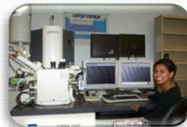
The ElectroOptics Institute and Nanotechnology Center (ERINC) http://www.ee.louisville.edu/~eri/