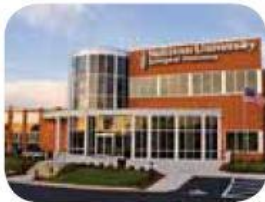
Sullivan University College of Pharmacy http://www.sullivan.edu/pharmacy