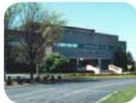
UK Center for Applied Energy Research (CAER) http://www.caer.uky.edu