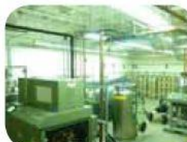
UK Center for Advanced Materials (CAM) http://www.kvnsfepscor.org/cam