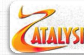
UK Catalyst Research and Testing Center http://crtc.caer.uky.edu/index.html