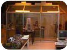
Murray State Microelectronics Lab http://www.murraystate.edu/qac/dcos/phy/facilities.html