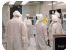
UofL Micro/Nano Technology Center (MNTC) http://www.louisville.edu/micronano