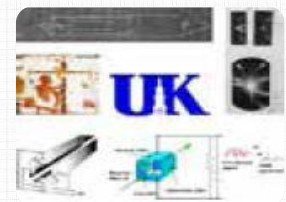
UK Mass Spectrometry Facility http://www.research.uky.edu/ukmsf