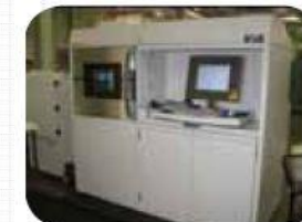
UofL Rapid Prototyping Center (RPC) http://www.louisville.edu/speed/rpc/