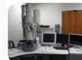
UK Imaging Facility http://www.mc.uky.edu/SharedResource/electron