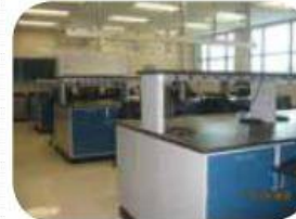
Morehead RF Micro Characterization Lab http://www.moreheadstate.edu