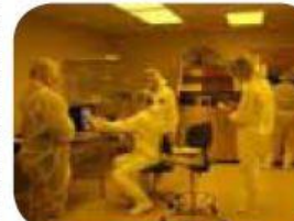
UK Center for Nanoscale Science & Engineering (CENSE) http://www.engr.uky.edu/~cense