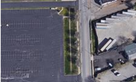
Purple Lot C RV Layout:

Replace area with exact layout of RV spaces that are in place in Purple Lot C. Label each spot RV1 – RV12