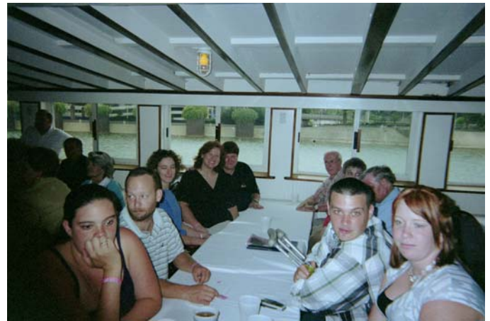
The special ACS tables