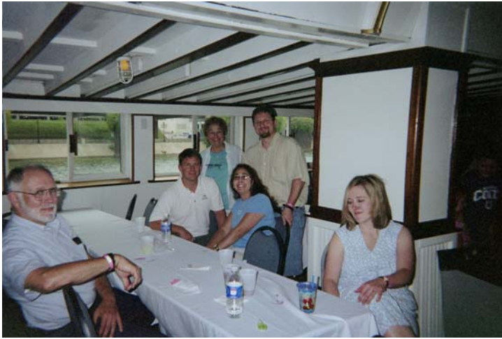
ACS members having fun!