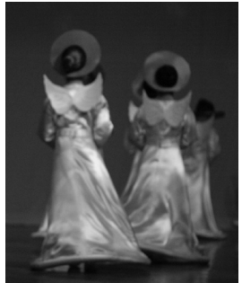
Our focus is in ballet because it is the technical basis for all forms of dance.

Please understand that different students progress at different rates and we will always assign students to the class level where they will benefit the most. This means that so-called "promotions" to a higher level are not automatic, and they are not