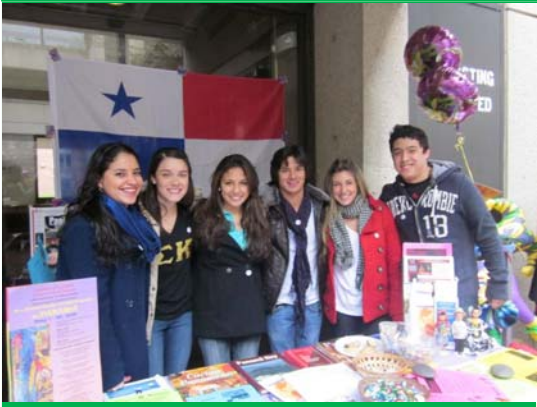
Students from Panamá studying at UofL celebrate Carnaval Around the World 2012 with LALS.