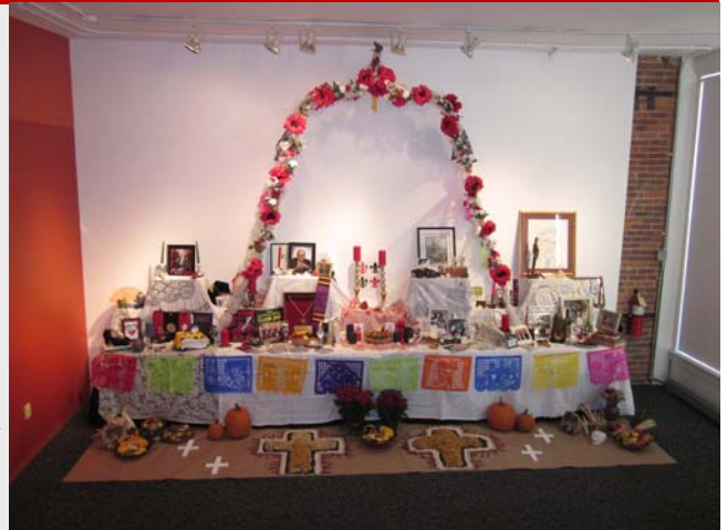
2011 LALS Downtown Day of the Dead Altar, "The Legacy of Community and UofL Leaders"

More than 2000 people attended the celebration of the Day of the Dead at the Kentucky Museum of Art and Craft, held each year on the first Friday Trolley Hop in November. LALS organized a team of about 40 student volunteers to assist with activities for the children and to serve food and drinks. The crowds viewed the Day of the Dead exhibits and altars, including the 2011 LALS altar, which paid tribute to "The Legacy of Community and University of Louisville Leaders." Months of planning went into the creation of this altar and involved collaborations with faculty, staff and students from several UofL Departments (Classical and Modern Languages, Sociology, and Women's and Gender Studies), the Cultural Center and Porter Scholars, and the Anne Braden Institute for Social Justice Research, as well as