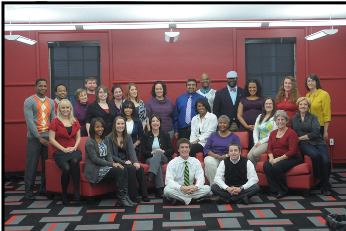
Housing staff awaits your arrival!