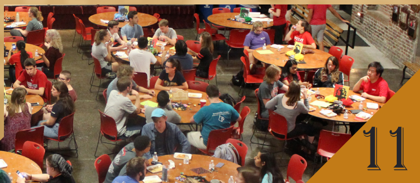
Images: [From top to bottom] 1. A team discusses their answers. 2. "The Slug Club" showing off their prizes for being the top team for the Harry Potter rounds. 3. "Exceptionally Brilliant but Pathetically Dimwitted," the winning team, with their prizes. 4. The red barn was packed with players enjoying Trivia Night.