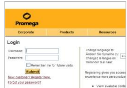
Login Web Page