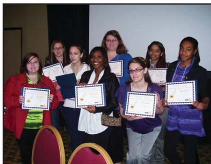
GEAR UP scholarship recipients from Fairdale, Iroquois, and Southern High Schools celebrate at the Drive the Dream Scholarship ceremony at the Marriott Hotel.

Council on Postsecondary Education News Release