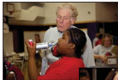
Students participate in asthma screenings