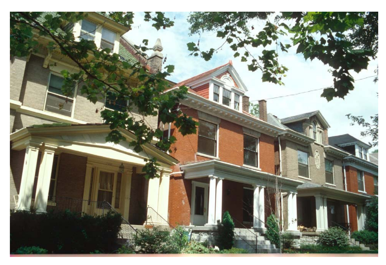
Louisville Metro Comprehensive Housing Strategy, March 2006, Page 23

The Mayor's Comprehensive Housing Strategy is a landmark tool for housing planning in the Louisville community. It positions Louisville Metro to meet market potential and to address existing unmet housing needs. The Comprehensive Housing Strategy will lead Louisville Metro to create and sustain housing for the future — in neighborhoods that include housing of all types and price points with access to public amenities and commercial and retail opportunities.