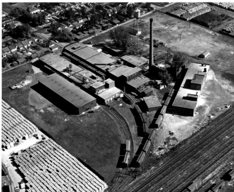
Black Leaf site decades ago.

Find more online later this evening and in The Courier-Journal on Wednesday.