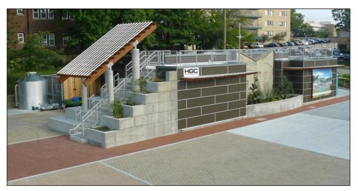
The Green Learning Station.

The Cincinnati Metropolitan Sewer District (MSD), faced with a need to lessen loads on municipal combined sewer operations, partially funded the project both as a way to reduce water directed from the site into the sewer and to educate community members about using GI to reduce infrastructure demands on the city. Since the site had never been officially designated a brownfield, GLS did not work with either state- or federal-level environmental agencies, but instead worked with MSD to develop a cleanup plan. According to GLS project manager Ryan Mooney-Bullock, MSD was "clear and