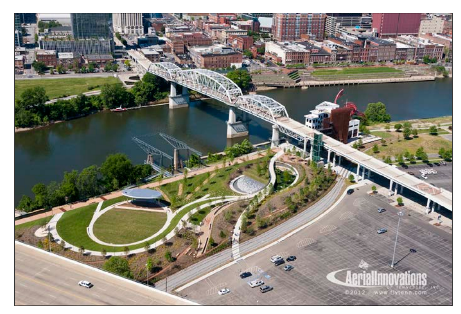
Cumberland Park aerial view.

The site of Nashville's waterfront park, now called Cumberland Park, was the first proposed in Nashville to take a brownfield site and a four-acre asphalt parking lot and convert it to a park with green infrastructure. Today, the park, which opened in April 2012, has not only reduced the load of on-site pollutants to a safe level for use as a park, but offers green infrastructure as an interesting environmental feature. Water runoff