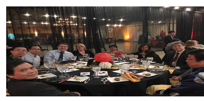
AST Faculty enjoying the Lunar Dinner and Auction hosted by the Asian Institute/ Crane House February 18, 2017