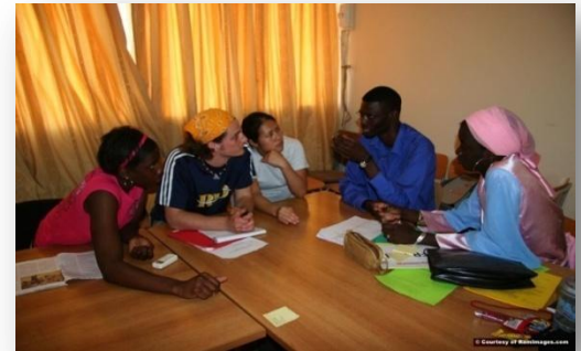
Ali Scholars and UGB Scholars in deep discussion at the first Ali Scholars Academy.

The Ali Street Scholar left the program and the second cohort of Ali Scholars, now seven students, traveled to Senegal for their summer international learning journey. In addition to participating in the first Ali Scholars Academy, the group partnered with seven students from the host institution Université Gaston Berger in St. Louis, Senegal. Besides the shared social and educational experiences, the students joined forces to create "Living Newspaper" dramas about two current issues in Senegal – the plight of talibes and the challenges of young women seeking higher education. The students performed the dramas for an audience of UGB faculty and students and led a lively discussion about the issues. The international trip of the second cohort marked a critical moment in the life of the Ali Scholars Program. Hosting the Academy and arranging the interaction of the students laid the groundwork for the future Ali Scholars Program at UGB. After their amazing two weeks of discovery in St Louis, the Ali Scholars spent a week in the capitol city of Dakar.