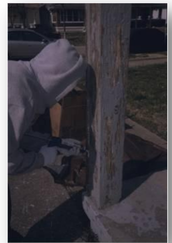
At work in the Louisville community