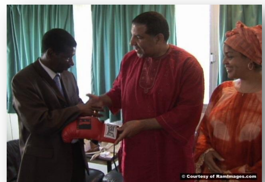
In a gesture of friendship, Ali Institute staff present UGB Rector (president) with a boxing glove signed by Muhammad Ali.

Most importantly, the English Department selected seven students to serve as UGB Scholars for the duration of the visit. These students embraced the UofL Scholars as friends, hosted them at the university, took them to classes, welcomed them into their social circles and gave the Ali Scholars an intimate window into Senegalese life by sharing of themselves.