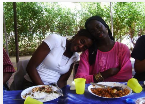
The best part about being an Ali Scholar is making new friends.