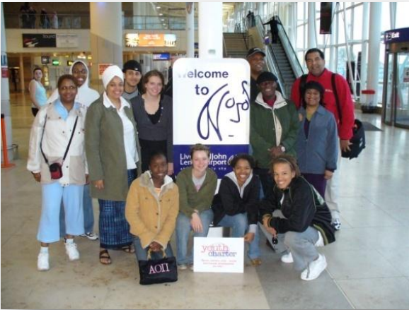
Ali Scholars and staff at Liverpool Airport in England.

The first group of Ali Scholars was selected in November 2005 and the program began in earnest with seven students in January 2006.