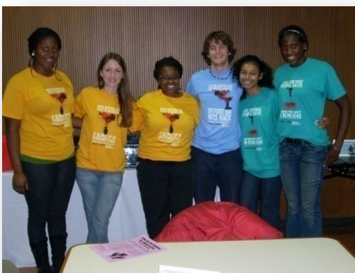
Ali Scholars at the launch of SeeRedNow at Peace and Justice Week 2008

Again in 2008, the Ali Scholars played a major role in Peace and Justice Week. The Ali Institute and red7e advertising firm transformed the Do No Harm Campaign into SeeRedNow . The Ali Scholars installed displays on campus to market the campaign and played leadership roles in launching the new effort. Their culminating project was a series of campus and community events creatively highlighting the six manifestations of violence and bringing SeeRedNow to life.