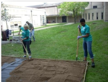
Getting to work early – the new Ali Scholars help Fern Creek High School build its peace garden.

The Ali Scholars Third Year has been established. Recent graduates of the Ali Scholars Program who will be enrolled at UofL for a full academic year beyond their cohort years can be Third Year Ali Scholars. These students have a higher profile at the Ali Center and support the MACCS. They also support the current Ali Scholars