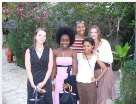
Ali Scholars at closing celebration in Senegal.

In their second year, the Ali Scholars continued their community service and completed a number of projects, including hosting a major exhibit on Darfur and lecture by an internationally renowned photojournalist and doing leadership development with a girls' group in Louisville.