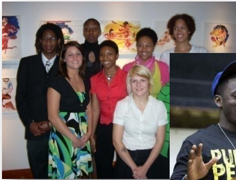
2009-2011 Ali Scholars at their induction ceremony.